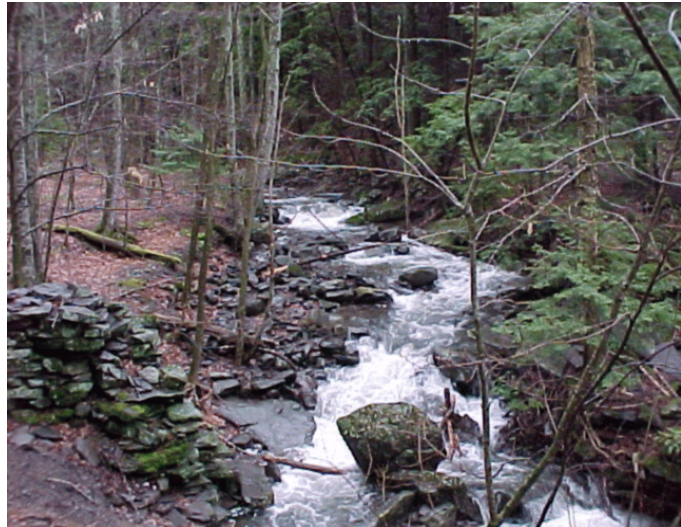
Figure IV-27: Vegetative cover and in-stream structure provided by large boulders provides excellent physical habitat for trout.

Currently, there is limited published data available on the status of fisheries habitat on the Batavia Kill besides the general characterization provided in the NYSDEC management plan. As a component of the Batavia Kill Stream Corridor Management Pilot Project, the GCSWCD has contracted with the U.S. Geological Survey (USGS) to conduct a study on the impact of restoration projects on fish habitat in the Batavia Kill. While the USGS focus is on limited reaches of the stream, their findings may be extrapolated to the rest of the watershed where the stream demonstrates characteristics similar to the study area.