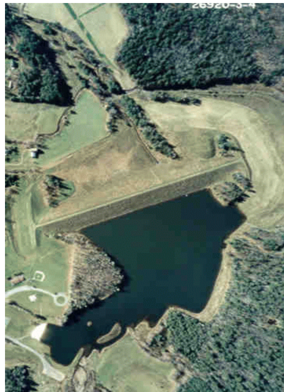
Figure IV-29: Cold water releases from the C.D.Lane lake help maintain aquatic conditions for trout.

If the US Fish & Wildlife Service standard of .5 cfs/mi 2 of watershed was possible with the siphon, it would require a release of 4.8 cfs based on the 9.9 mi 2 watershed. At this release rate, it was projected that the cold water resource in the lake would be expended by mid-summer. If an average release of 2.9 cfs is maintained, the estimated cold water storage of 149 acre feet (in June) will last until mid September, which would be past the time that the surface waters of the lake begin to cool to a point satisfactory for release.