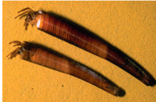
Figure IV-28: Caddisfly larvae (shown here) are sensitive to degradation of water quality and are a good indicator species.

The NYSDEC reported that the Batavia Kill and the sampled tributaries demonstrated excellent water quality, and were assigned a designation of non-impacted. It was noted that the sampling site just below the hamlet of Windham exhibited higher populations of aquatic worms that are often associated with enriched conditions from conventional pollution sources such as on-site waste systems. It would be reasonable to assume that construction of the proposed wastewater treatment system for the hamlet areas would mitigate this condition.