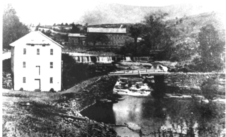
Figure IV-43: Photo of Federal City at the Red Falls area. The falls are located behind the bridge in the center of the photo while the road from Ashland to Prattsville (now Rt 23) can be seen behind the white building on the left. Date unknown

While available population data does not provide for distinguishing between hamlet residents and those in the remainder of the watershed, observations would suggest that residential properties outside the hamlets are predominant, with commercial and retain land-uses located primarily in the hamlets and the immediate road corridors. With the exception of Maplecrest, the hamlets of Hensonville,