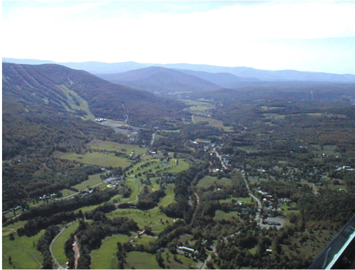
Figure IV-2: Aerial view of Batavia Kill watershed. Windham Mountain ski slopes are seen on the right of the photo.

Most significant in the consideration of the Batavia Kill's regional setting, is its location within the New York City watershed. The Batavia Kill watershed is a sub-basin of the